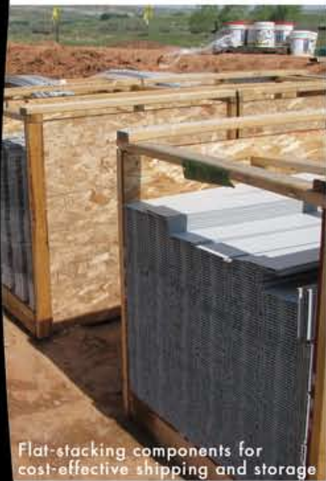
Flat-stacking components for cost-effective shipping and storage

Designed to meet your specific project requirements