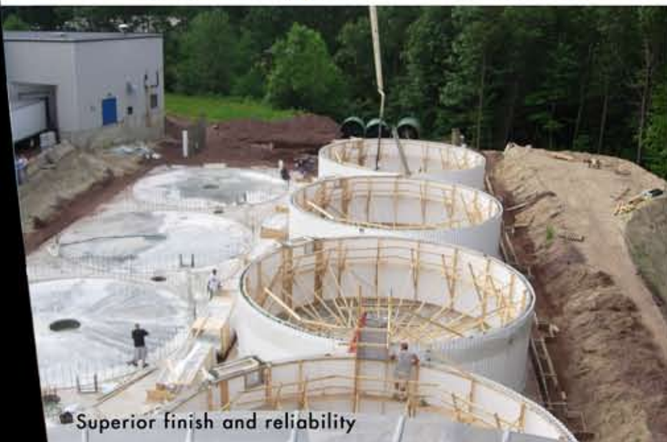
Superior finish and reliability