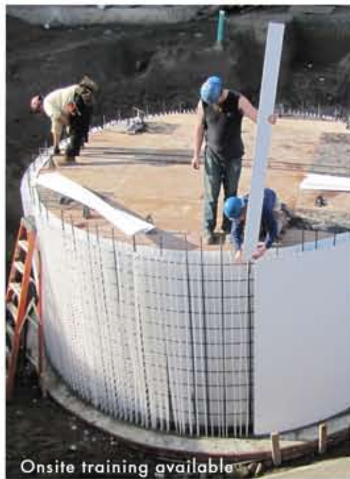
Onsite training available