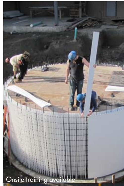
Onsite training available