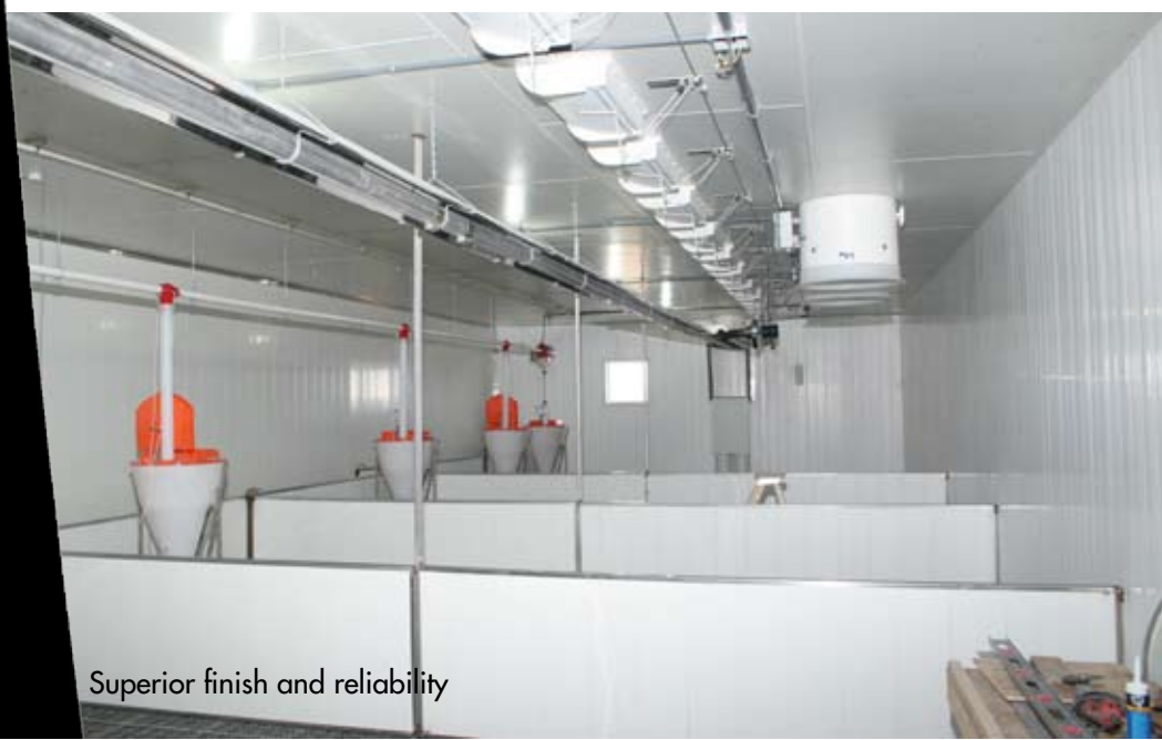
Superior finish and reliability