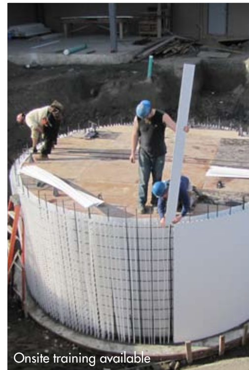
Onsite training available