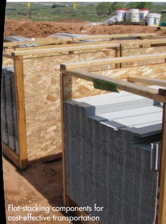
Flat-stacking components for cost-effective transportation

Designed to meet your specific project requirements