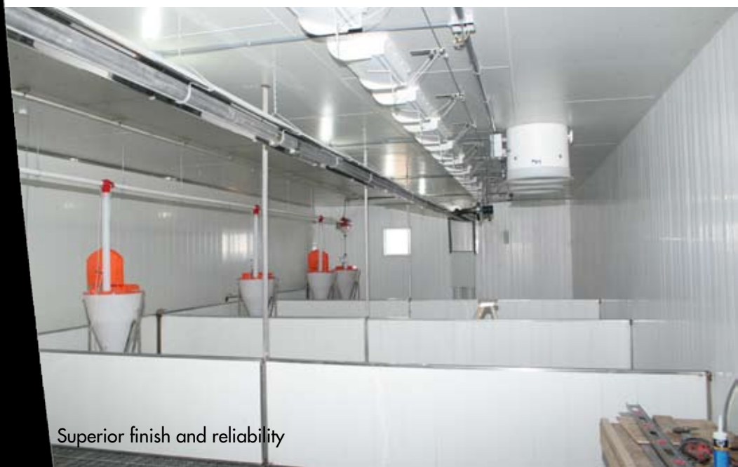
Superior finish and reliability