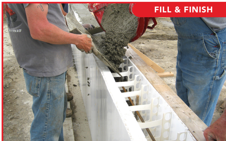
FILL & FINISH